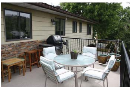
Entertainment sized deck off of dining room/kitchen or easy outdoor living