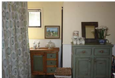
"mud room" with separate entrance to mother in law suite