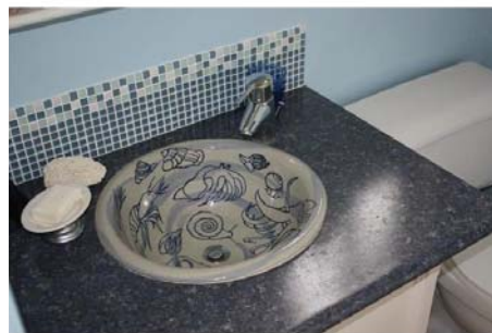
One of a kind vanity basin in Master bedroom 3 piece ensuite