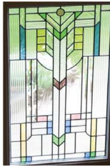
Stained glass in front door