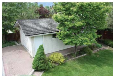
Gargage/shop with paver-tile patio and sidewalks