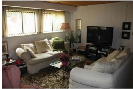
Suite Living room