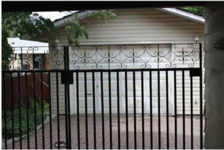
Fully fenced backyard with garage/shop