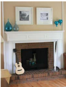
Cozy wood burning fireplace