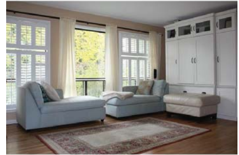
Bright and spacious Living Room with oak hardwood