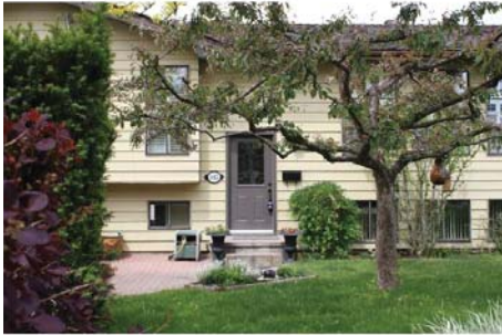
Welcome to 1682 Willow Crescent. You won't want to leave!