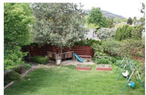
Very private backyard with children's play area