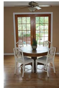
Dining Room with French doors that open onto large deck overlooking private backyard