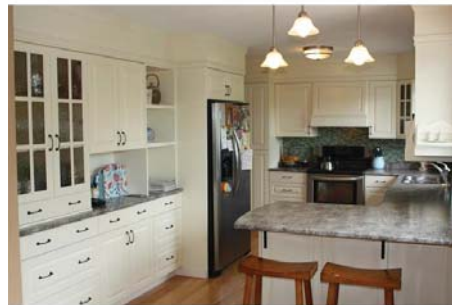
Beautiful renovated kitchen with stainless steel appliances and glass tile backsplash